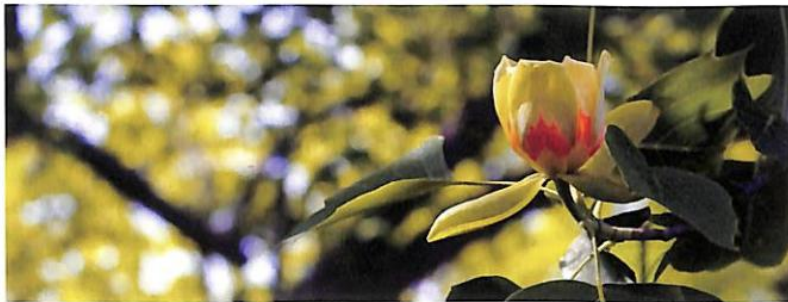
▲ The tulip tree blooming in the Mayflower Society House gardens.